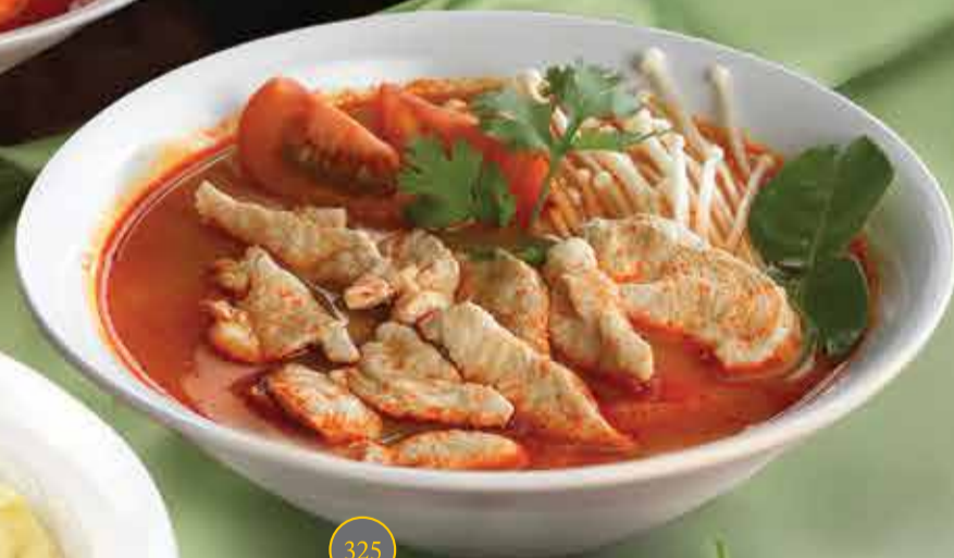
Chicken Tom Yum 325