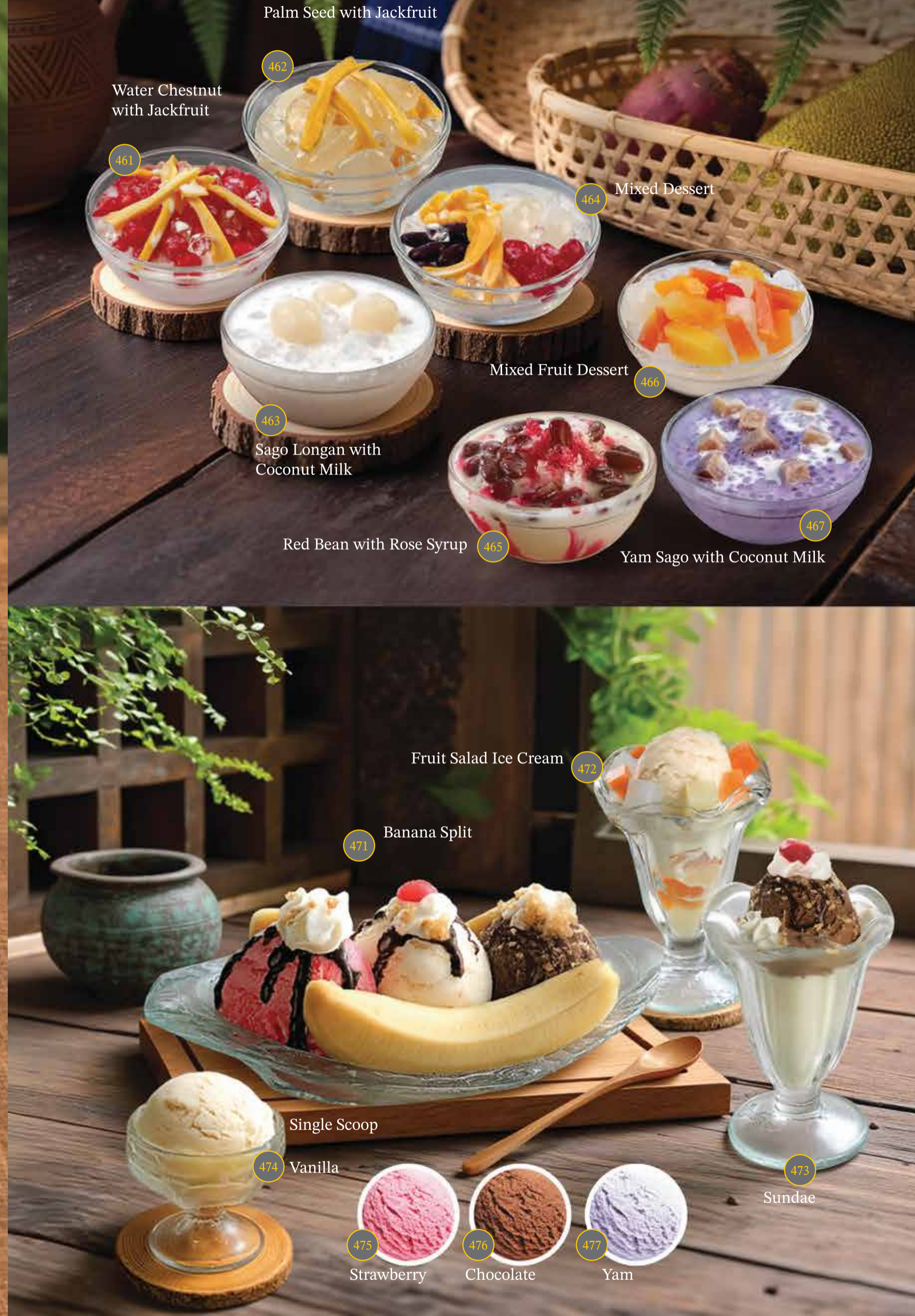
Palm Seed with Jackfruit