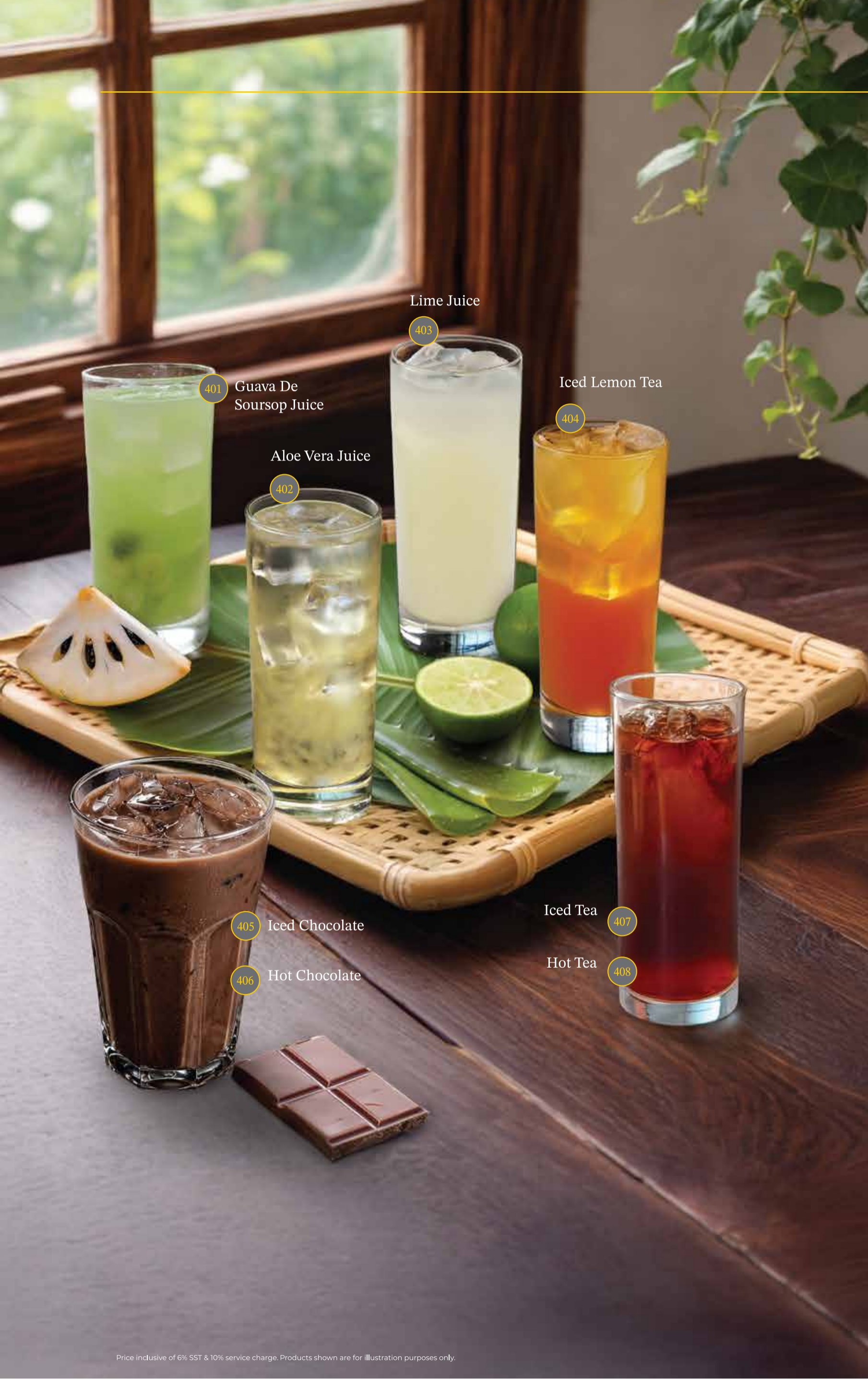
401 Guava De Soursop Juice