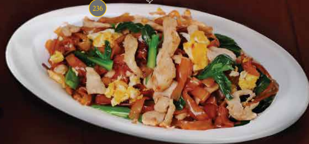
"Pad See Ew" Stir-Fried Kuey Teow with Chicken