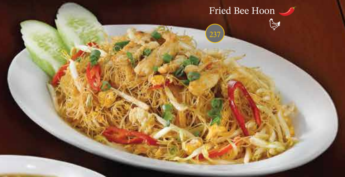
Fried Bee Hoon

Wok-fried noodles infused with smoky aroma, tender chicken slices, and rich soy sauce goodness. It's a true Thai comfort dish.