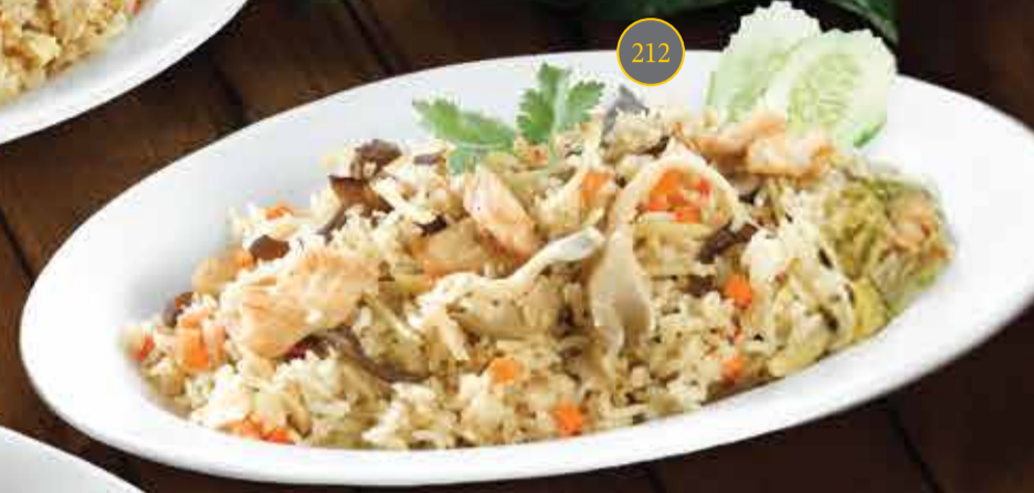
Prawn Fried Rice