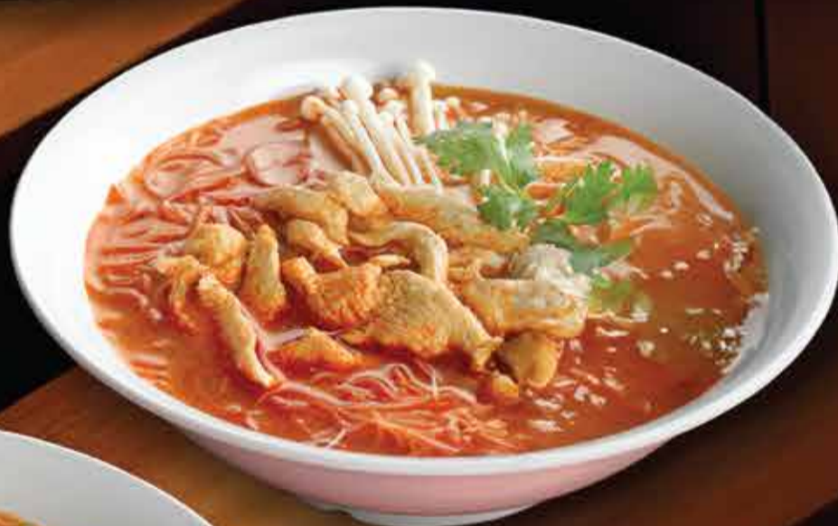
232 Chicken Tom Yum with Bee Hoon