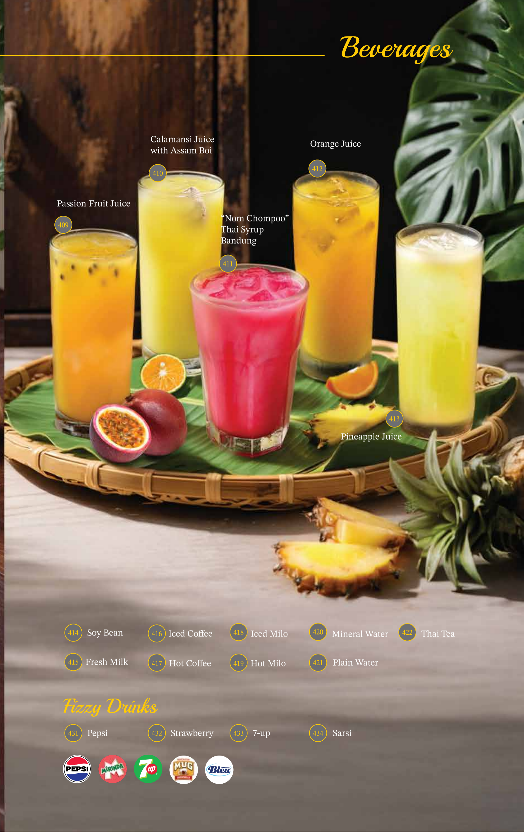
409 Passion Fruit Juice