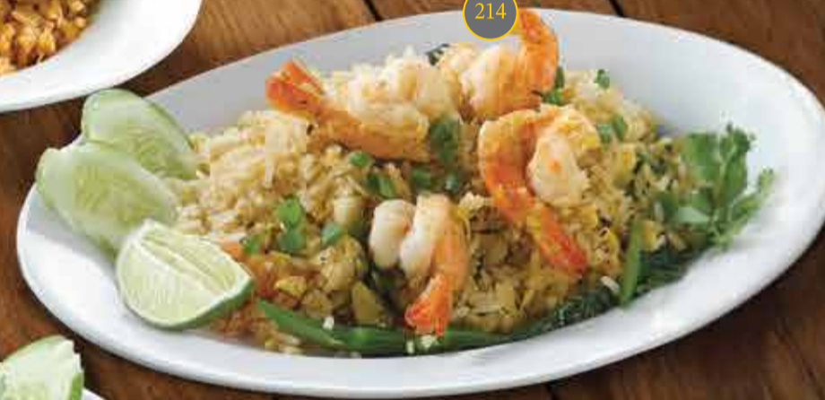
Belacan Fried Rice