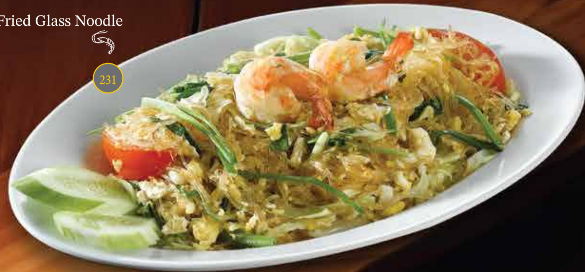
Fried Glass Noodle

Enjoy our fried glass noodles—perfectly wok-fried with prawns, aromatic Thai herbs, and crisp vegetables for a light yet flavorful bite. It's a fragrant, savory dish that captures the essence of authentic Thai cooking.