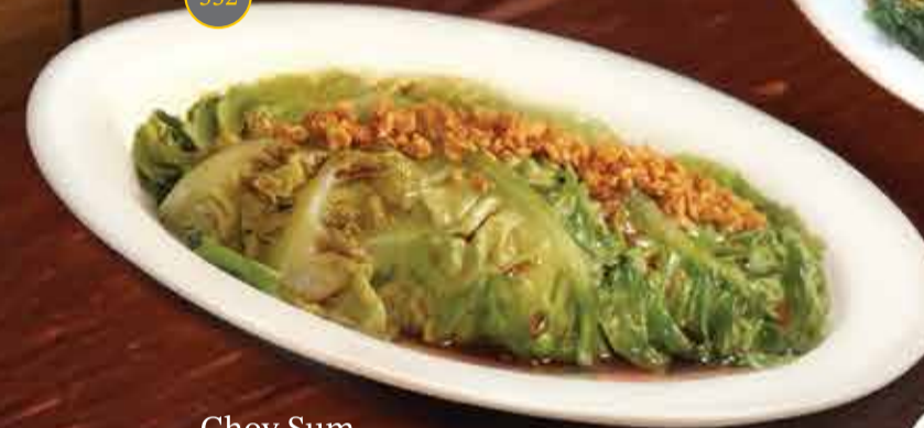
Lettuce with Dark Sauce 332