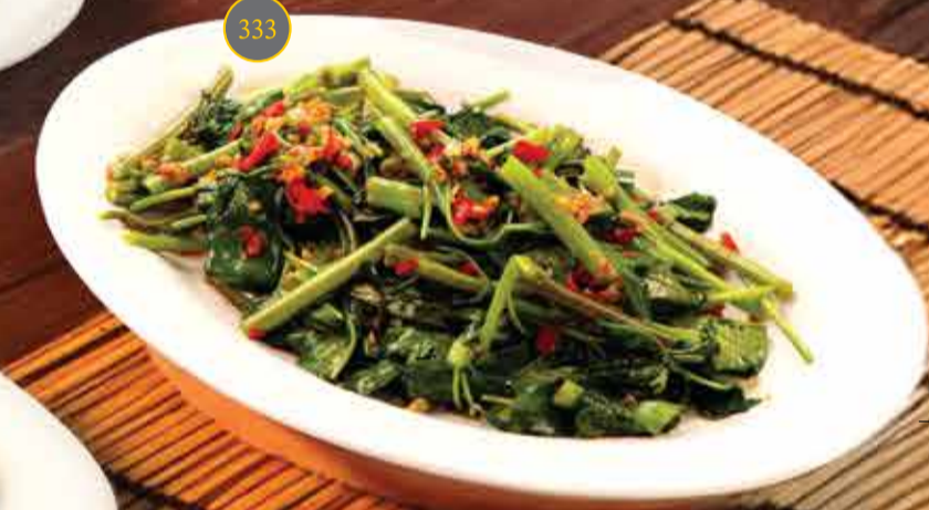
Stir-Fried Kangkong 333