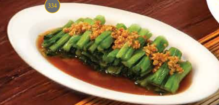
Choy Sum with Oyster Sauce 334