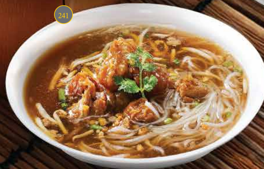
Ravioli Soup with Bee Hoon