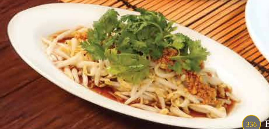
Bean Sprouts with Dark Sauce 336