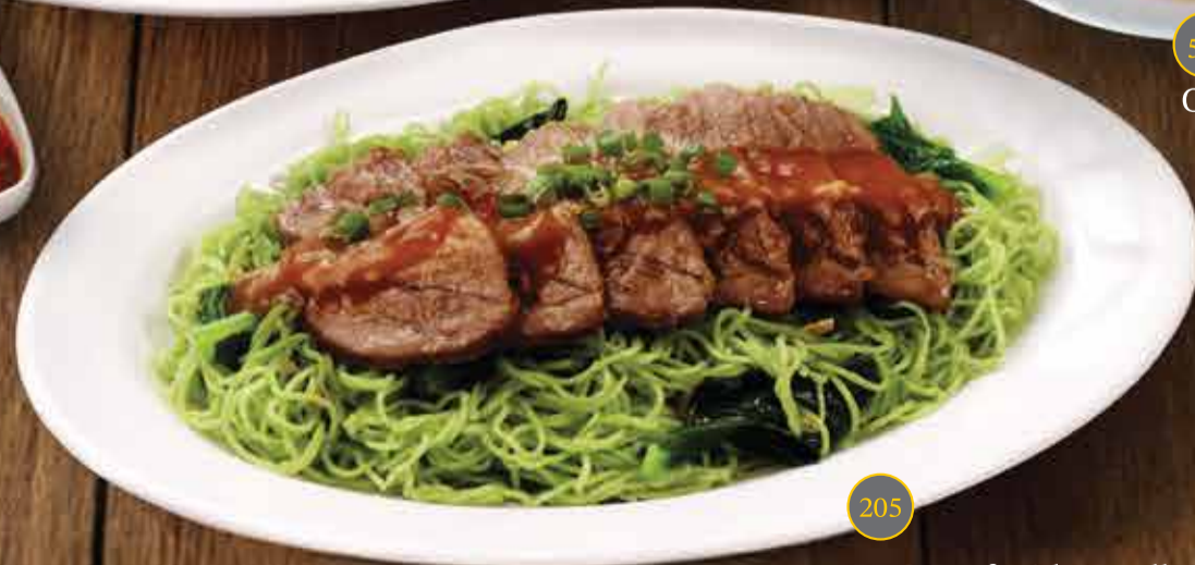
BBQ Beef with Noodle