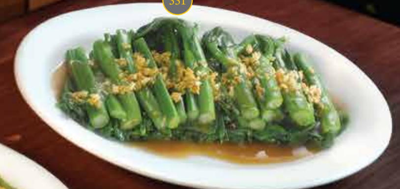
Kailan with Oyster Sauce 331