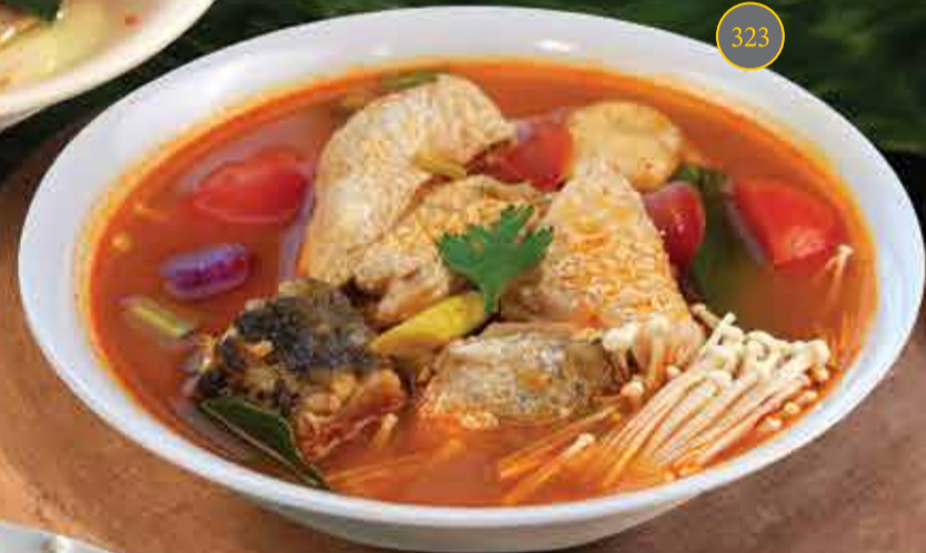
Fish Head Tom Yum 323