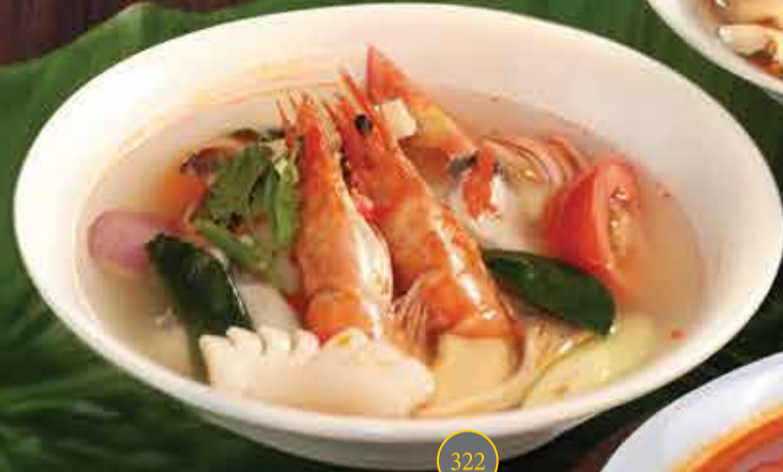
Clear Tom Yum Seafood 322