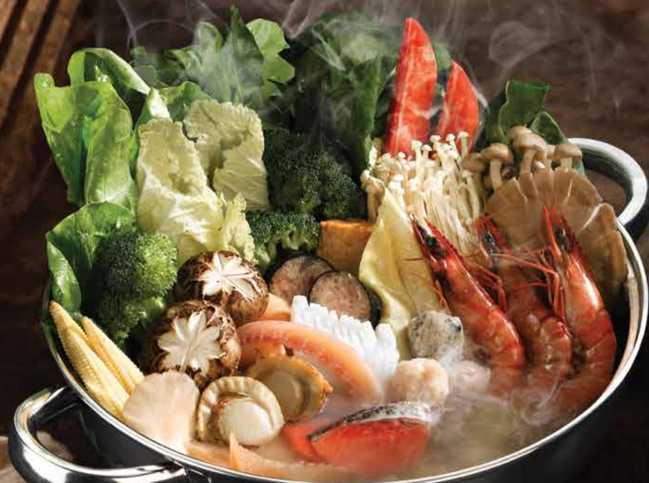
Chicken Soup (FOC)